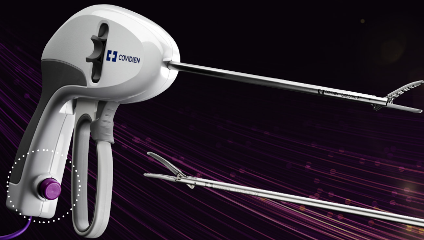
LigaSure™ XP Maryland jaw devices